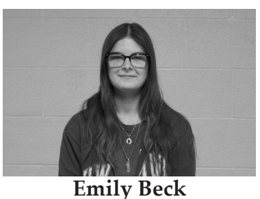
Senior "Yes. They could open a portal and he could pop out and everyone would be so surprised."