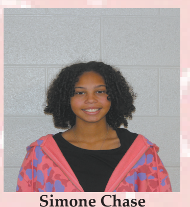
Junior "It's a Wonderful Life because it held sentimental value."